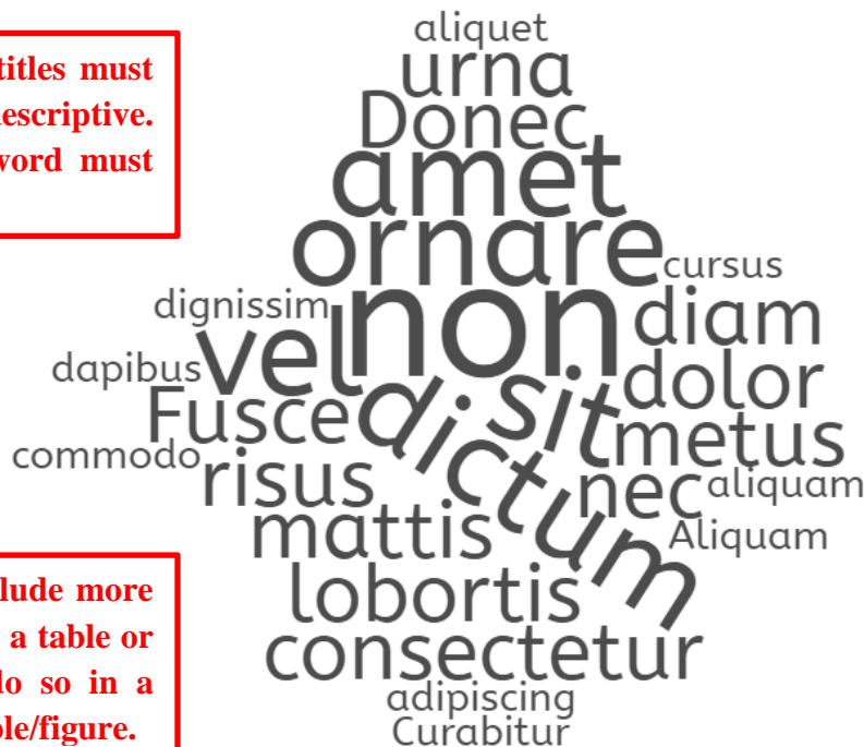
Figure and table titles must be short and descriptive. Each important word must be capitalized.*

If you need to include more information about a table or figure, you can do so in a Note below the table/figure.